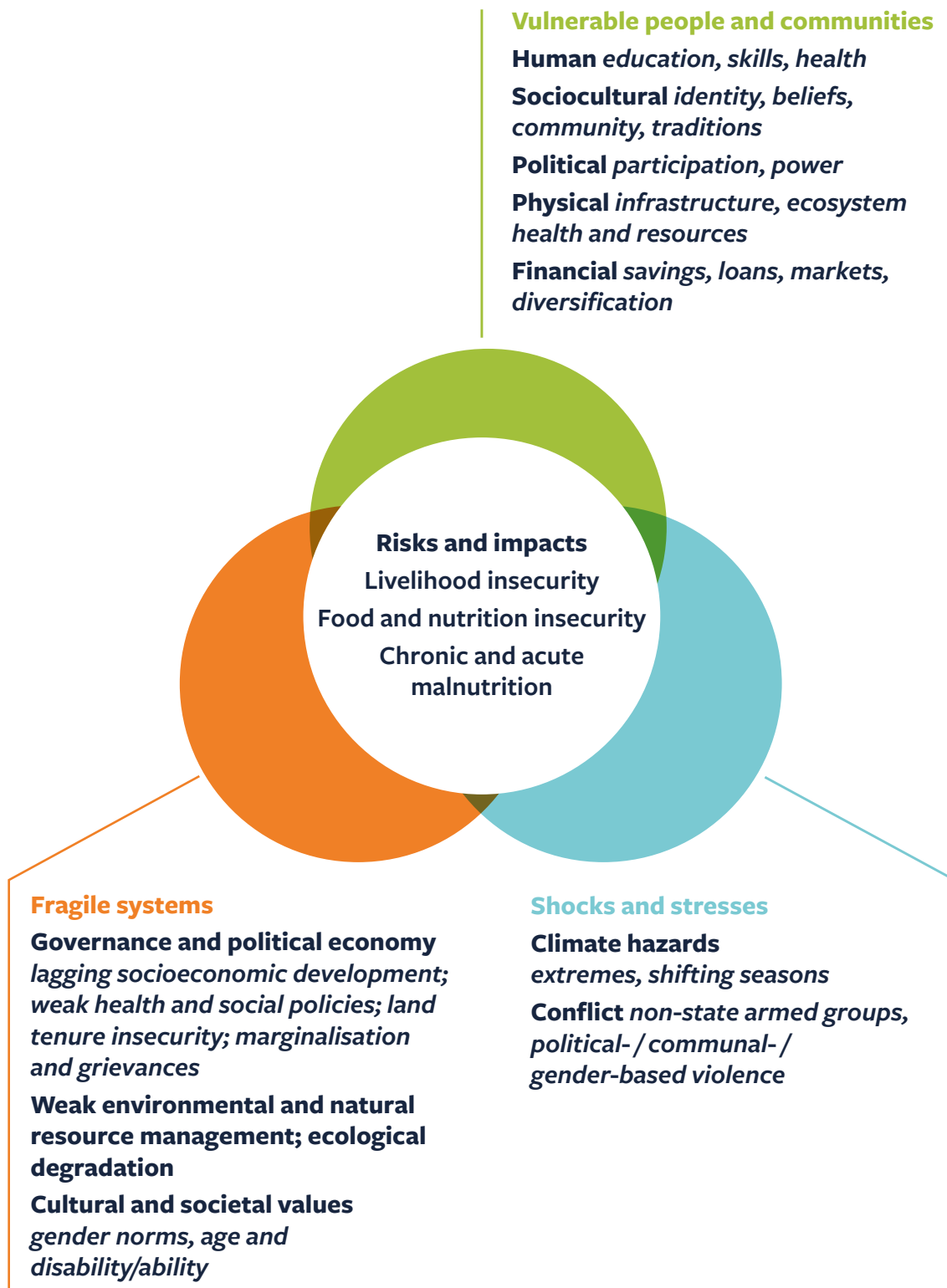
Figure 2 Fragile systems create vulnerabilities for people and communities, such that when shocks and stresses occur, they can have disastrous impacts on livelihoods, access to food and nutrition.